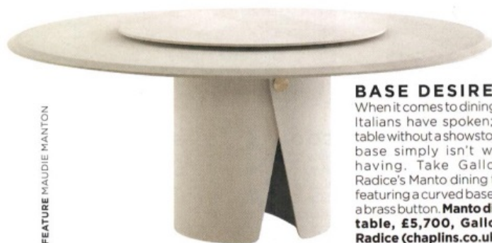
FEATURE MAUDIE MANTON

The statement Manto dining table can be customised with a retro-feel lazy Susan swivel top